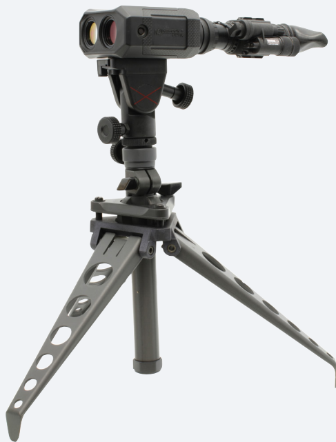
Shown in night vision configuration