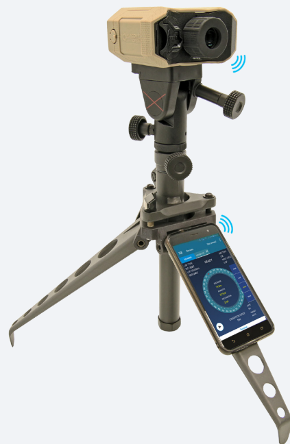
Shown in active bluetooth mode