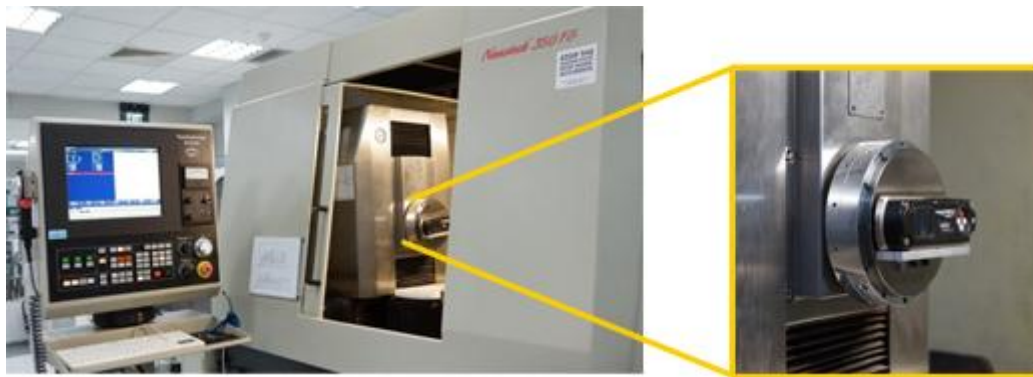
Moore Nanotechnology Systems – NanoTech 350FG (USA)

Digi-Pas® Digital Levels are built with advanced digital MEMS Technology Sensor and precisely calibrated for non-linearity for entire measurement range using high precision computer numerical controlled machines with resolution of 0.0001^\circ ( < 1 arcsecond). The accuracy and repeatability conformance of these highly specialized machines are tested and verified by ultra-high precision Moore Nanotechnology Systems ( <0.03 arcsecond) – NanoTech 350FG (USA) and also calibrated by world-leading accredited certification bodies. This has demonstrated Digi-Pas® technology and capability to develop world-first dual-axis high precision machinist level having wide-angle planar measuring range for leading-edge applications in precision CNC machining, medical, metrology & aerospace industries.