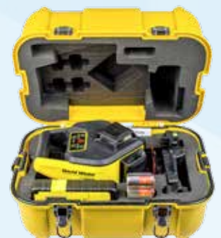
Robust padded carry case