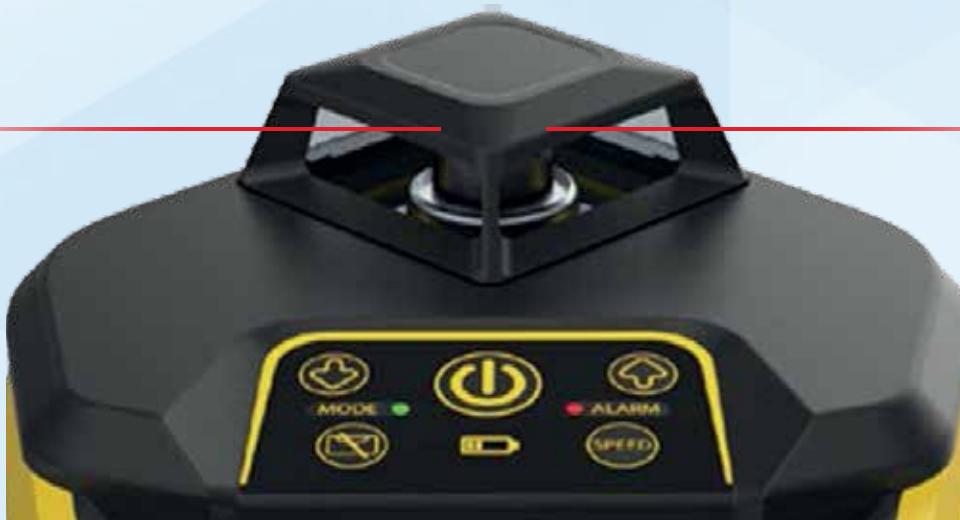
Horizontal Visible Beam