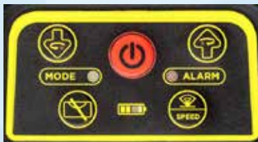
Easy to use control panel