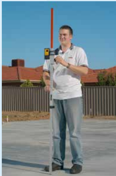
Concrete slab preparation using Smart Receiver in vertical position with Combo Rod