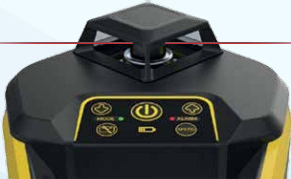
Horizontal visible beam