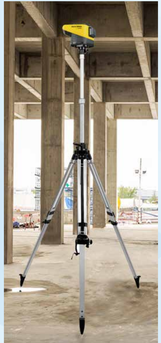
Shown using telescopic tripod model W-92