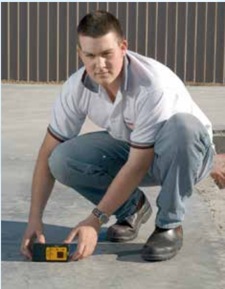
Showing right angle setout using Smart Receiver in horizontal position