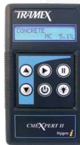
Product order code: CMEX2