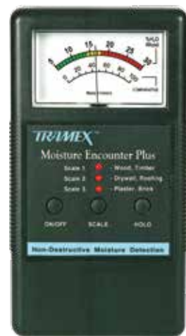
Product order code: MEP