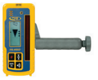
HL450 Receiver and C45 rod clamp included (Other configurations are also available.)