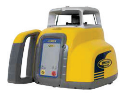
LL300N features a strong metal sunshade

Unit 7 /7 Prindiville Drive Wangara WA 6065 Ph: 08 9409 4058 sales@gsrlasertools.com.au www.gsrlasertools.com.au