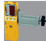
Outdoor Receiver with Staff clamp