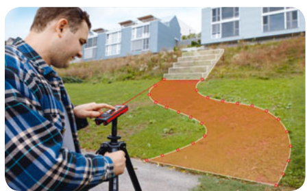
Measuring points and areas