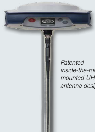
Patented inside-the-rod mounted UHF antenna design