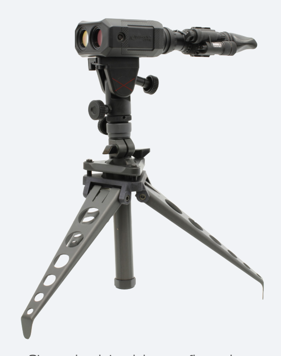
Shown in night vision configuration