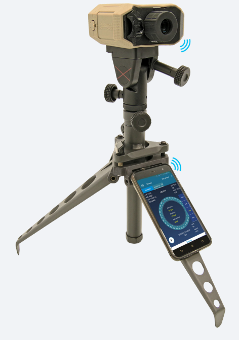
Shown in active bluetooth mode